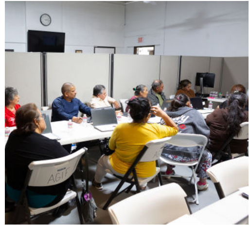
SBF American GI Forum, 2024

Despite the high number of connections that currently exist across Santa Barbara County, there are pockets of the population in each community where broadband adoption is limited by barriers including affordability, access to technology, and low digital literacy. The digital divide disproportionately impacts marginalized communities that require specialized outreach and training to empower community members to utilize digital tools to improve their access to economic, educational, social, and health opportunities. The Digital Equity Coalition provides a venue for practitioners to coalesce strategies to reach under-connected and unconnected community members, to share best practices, to collaborate, and to coordinate efforts to apply for funding opportunities and develop effective programs.