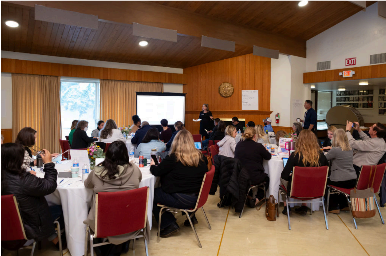
SBF Digital Equity Collaborative in Solvang 02.06.2024